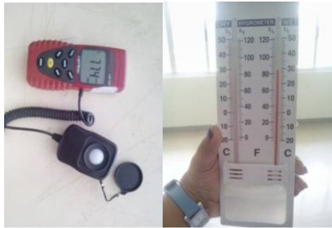
c) Lux meter