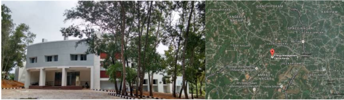
Fig. 2: Study Area

The main features of Green building of Energy Management Centre are: