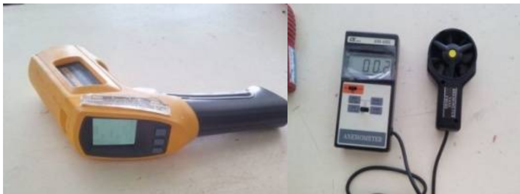
a) Infrared Thermometer

The hand-held calibrated digital instruments were placed at a height of 0.9 m from finished floor level, positioned at a distance of 1m from both the side walls and at the centre of the rooms. Minimum 5 to 7 days were spent in each month during post monsoon season to collect indoor environmental data from the green building.