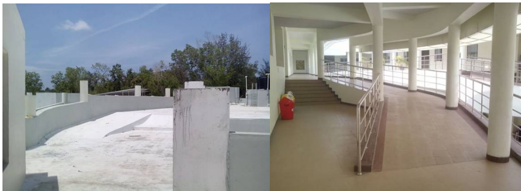
Fig 3 a ) Terrace painted with white paint having high SRI Fig. 3 b) Corridor

Some of the key features of the study area mentioned above are shown in figure 3.