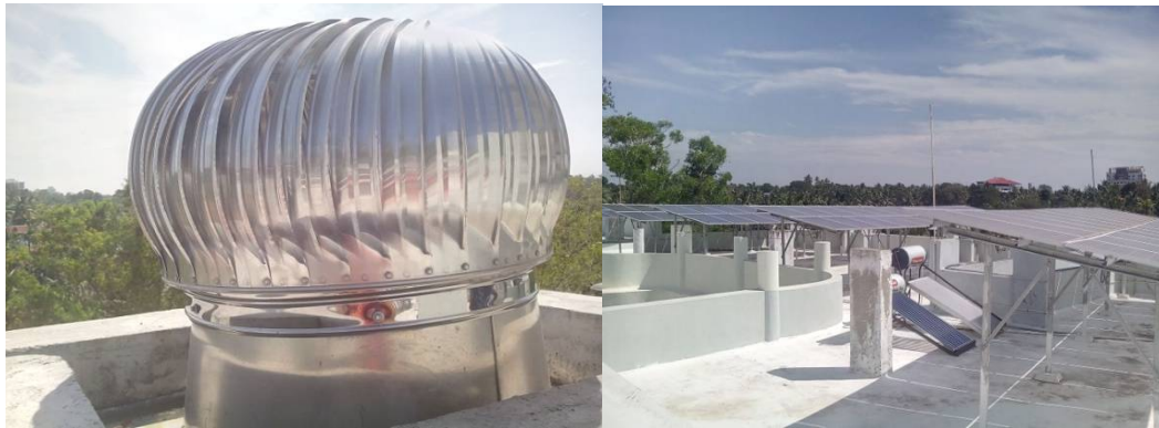
Fig. 3: c) Turbo ventilation